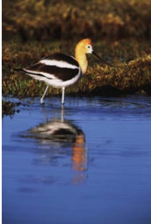
American Avocet by Floyd Bond

Please come and support your local artists!